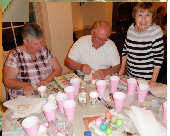
Members of the Skipjacks crew competed for the best decorated Easter egg at their April meeting.