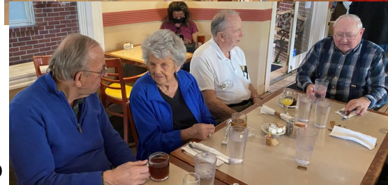
Clipper Ship enjoyed lunch at Danielle's Creperie for their April gathering.