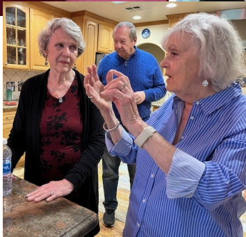
Companionship's 14th annual Trivia Day was filled with smiles and fun!

write the answer to a clue at the bottom of the page. The second Imagram had photos of four precious gems. Again we had to write the name of each and unscramble the circled letters to answer the clue at the end of the page.