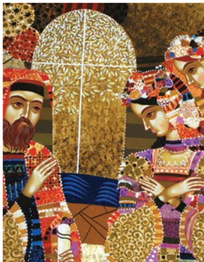
"Lydia Encounters Jesus in Worship" based on Acts 16:11-15 is the April PW study lesson.