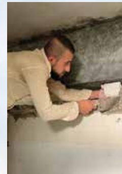
HOUSE RESTORATION - VILLAT

Each gift to One Great Hour of Sharing helps improve the lives of the suffering and the vulnerable through three life-saving programs ~