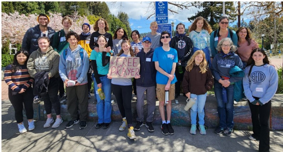
The 30-Hour Famine team from Carmichael, Faith, and Westminster Presbyterian Churches.

Last month, CPC, Faith Presbyterian, and Westminster Presbyterian youth groups teamed up and fasted for 30 hours over a weekend at Westminster Woods. The goal of this time was to raise money to feed to the kindness of our communities we were able to raise $6,000!