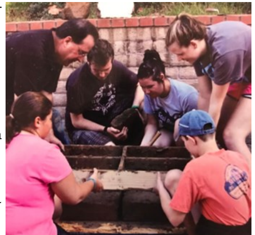
CPC's youth making adobe bricks in 1945 and again in 2011.