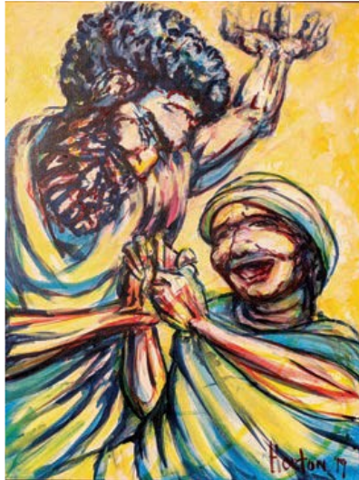
"People Encounter Jesus Through the Work of the Disciples" is the May Presbyterian Women study lesson.

Our final lesson in this series, Lesson 9: "People Encounter Jesus Through the Work of the Disciples" starts with the scripture reading from Acts 9:36-43 and will focus on how the community of faith relies on the power of Jesus Christ in times of crisis.