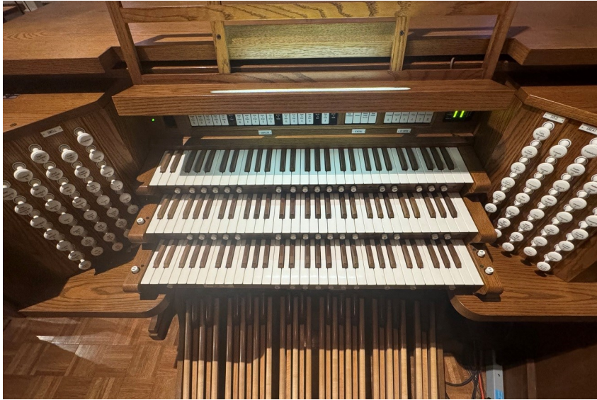
CPC's organ from the organist's perspective.

The MIDI controller is in a drawer under the main console, which I discovered by banging my knee when I first sat down at the organ. A drawer under